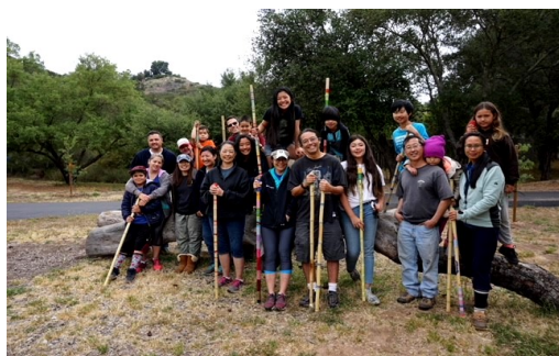
Campers pose with their walking sticks after hiking to Potato Chip Rock during the Dharma School campout at Dos Picos campground near Ramona.