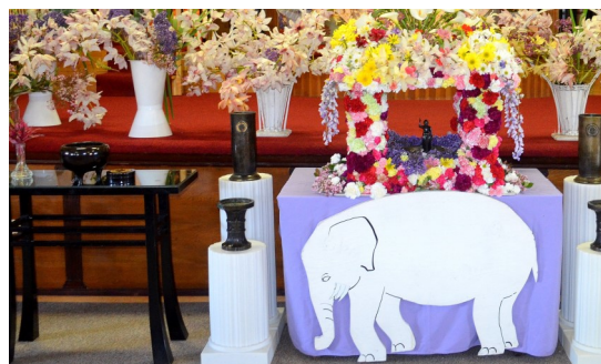
HANAMATSURI: COMMEMORATING THE BIRTH OF SAKYAMUNI BUDDHA