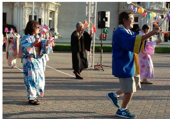
2016 Golf Tournament