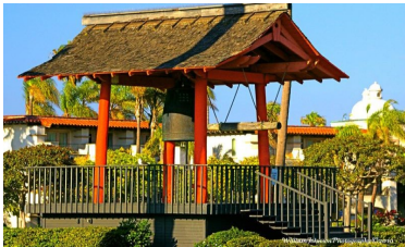
New Year's Eve Bell Ringing